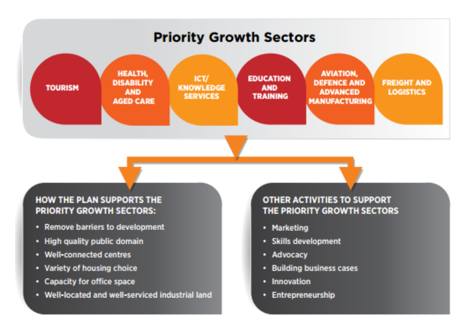
FIGURE 5: SUPPORTING PRIORITY GROWTH SECTORS

The RDA Illawarra '<u>Transition Illawarra</u>' <u>Deloitte Access Economics</u> (Update 2015) provides the projected employment for each sector of the economy at Chart 7.3, see Figure 5 below.