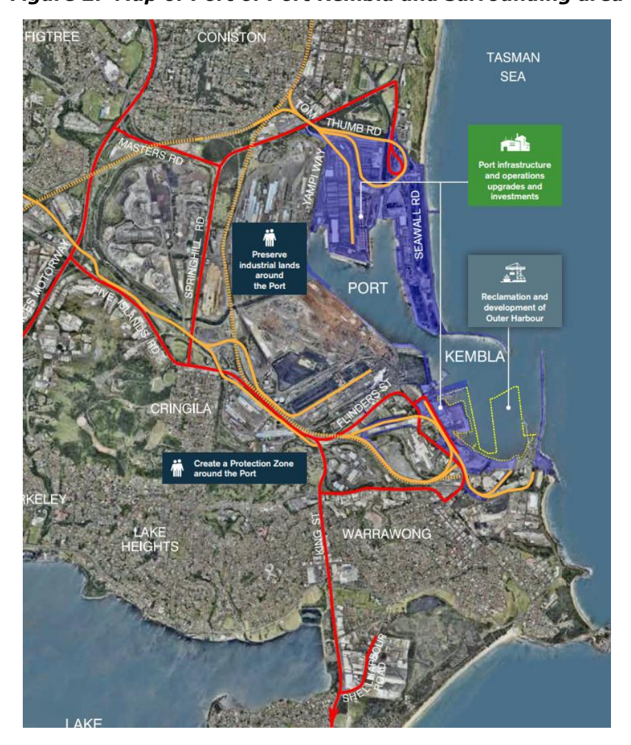
Figure 2: Map of Port of Port Kembla and surrounding area

Port Kembla is Australia's largest vehicle import facility, has the largest grain handling terminal on the East Coast and is the second largest coal export facility in NSW. It is a key driver of economic growth in the Illawarra region, with capacity to expand following further Outer Harbour infrastructure development, and therefore has the capability to benefit from an expansion of international trade.