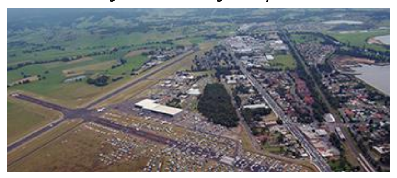
Figure 7: Illawarra Regional Airport

A Regional Passenger Transport service could assist both the aviation industry which is already operating at the Illawarra Regional Airporat, as well as support tourism industry growth in the Illawarra.