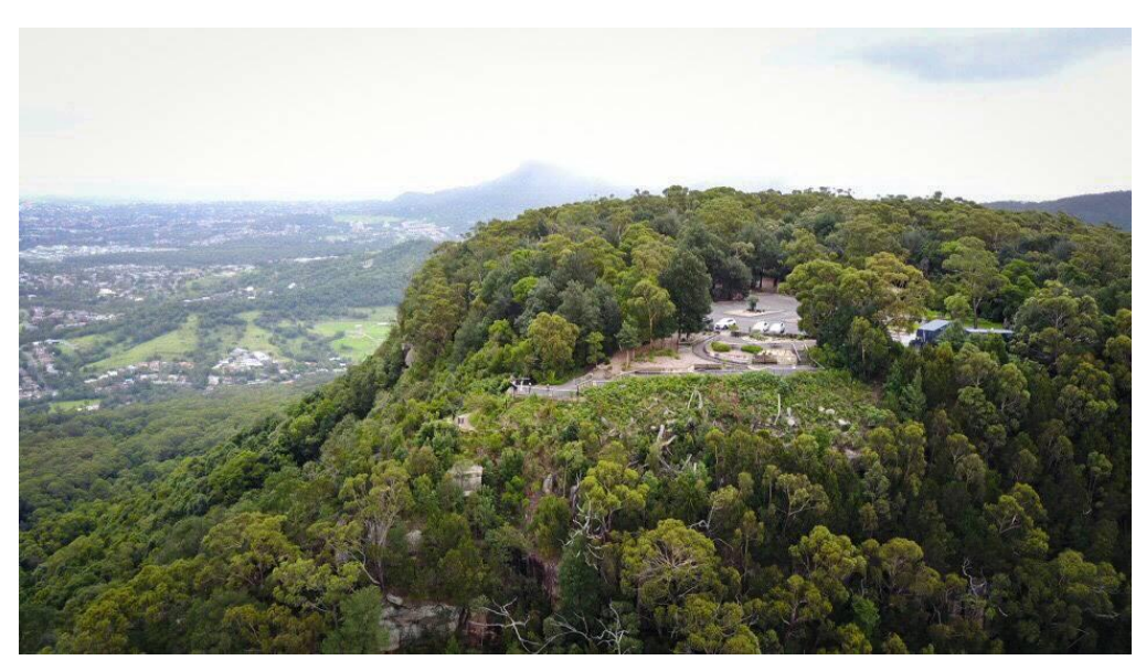
Mount Keira Summit Park