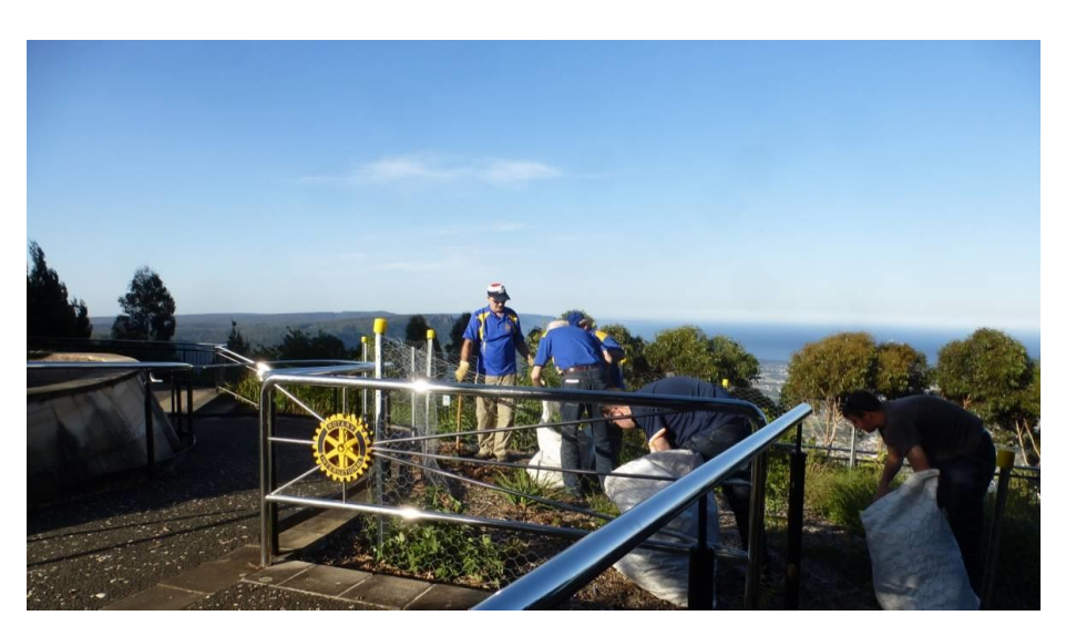
Rotary volunteers serving Mount Keira since 1950's

In addition, we recommend that the Plan of Management includes Mountain Biking as a permissible use.