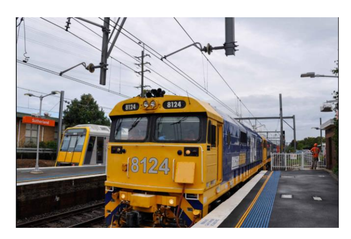
Freight and passenger rail competition in Sydney, serving Port of Port Kembla

Furthermore, the Plan notes (p. 55) 'Access to Port Kembla is congested due to competition with passenger rail as the route progresses via the Sydney metro network to the Illawarra line. This will worsen as metropolitan passenger services grow. Pursuing opportunities to separate freight and passenger rail will alleviate this impact.' This is demonstrated diagrammatically below, with a coal train (8124) transporting coal to/from the Port of Port Kembla adjacent to a Sydney commuter train – noted here at Sutherland station.