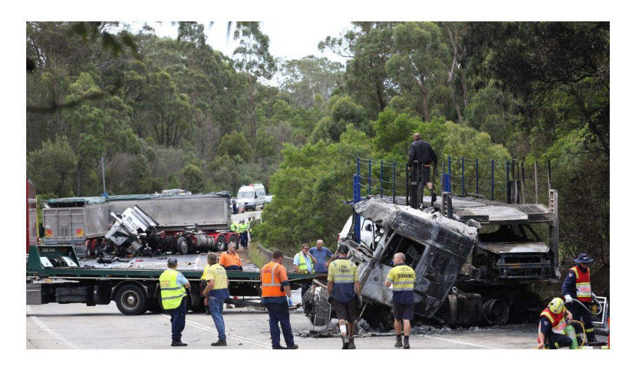
24 March 2017, Two truckies killed in a head on accident on Picton Road, Daily Telegraph

Safety on Picton Road has been an ongoing issue. Despite several road improvement <u>projects</u> over the last decade to address safety concerns, accidents and fatalities are still occurring on this major heavy vehicle and growing freight corridor. See below a double fatality example from March 2017.