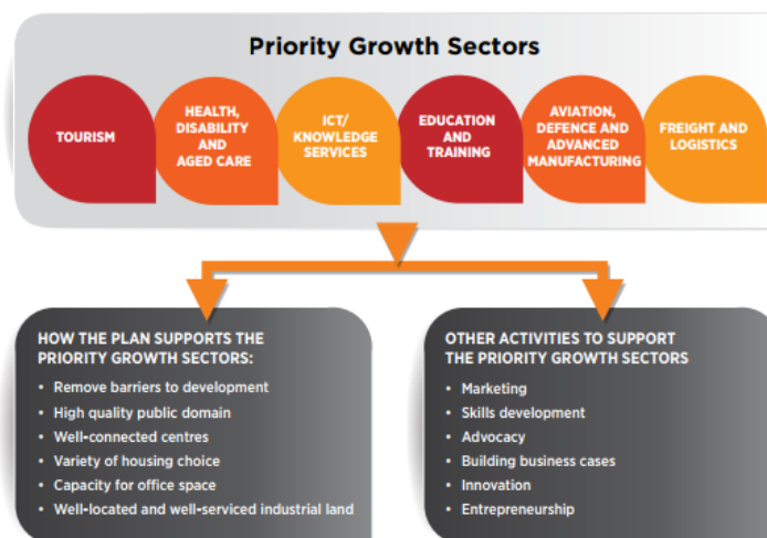
FIGURE 5: SUPPORTING PRIORITY GROWTH SECTORS

The City of Wollongong is the regional capital of the Illawarra and demonstrates the regional centre consolidation observed by the Commission in its key points. Elements of this consolidation have been a result of deliberate policy when revitalizing the CBD in recent years.