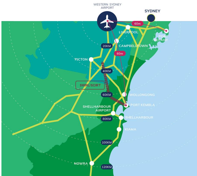
Delivery of a direct rail link from Port Kembla to Western Sydney will facilitate passenger and freight movements, reduce congestion on the South Coast line and create opportunities for intermodal facilities

As a dual track line, it also links passengers from the growth centres across the Illawarra and at Wilton to new opportunities in Western Sydney.